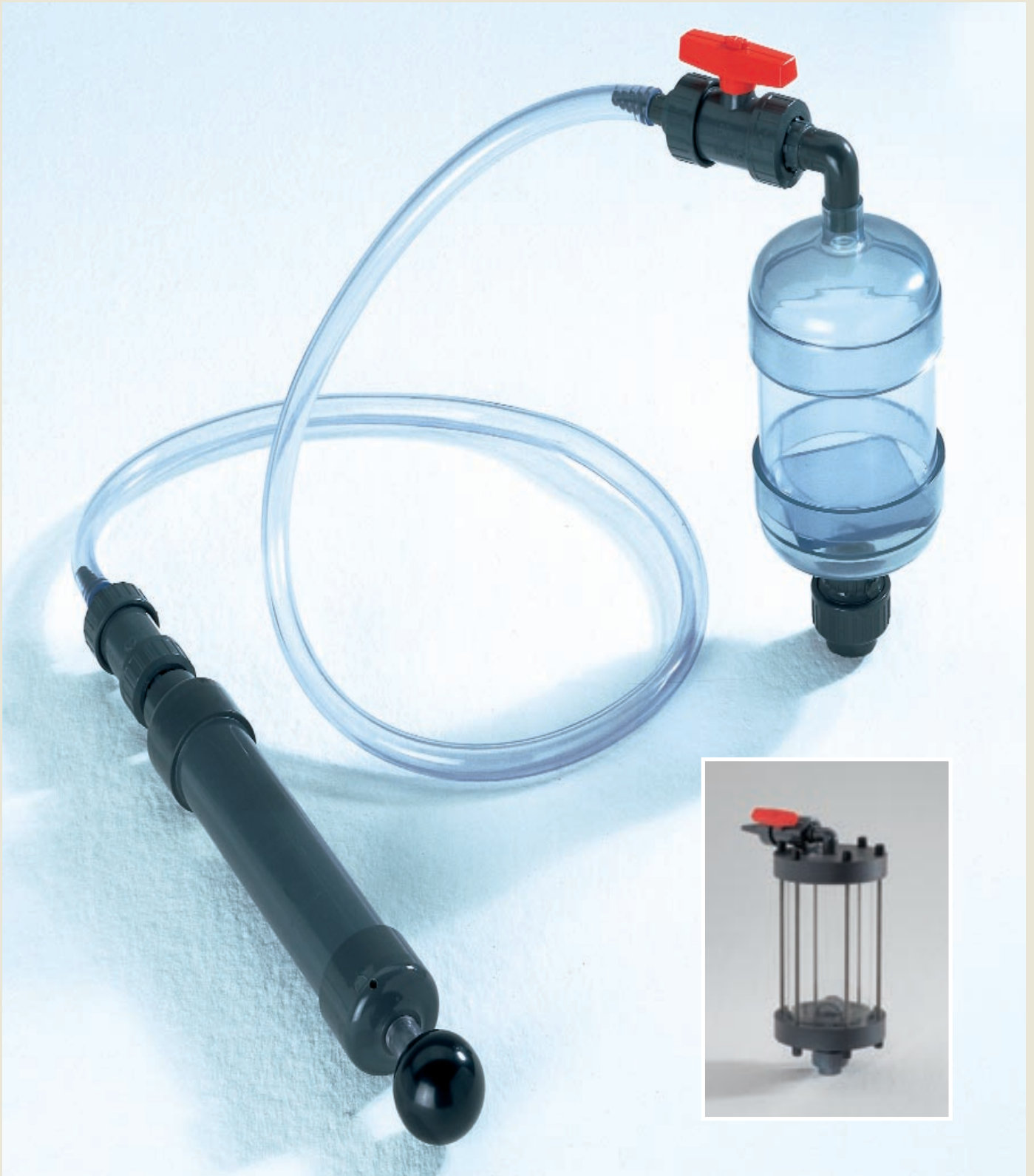
Siphon and vacuum hand-pump

For overhead evacuation of chemical liquids from storage tanks