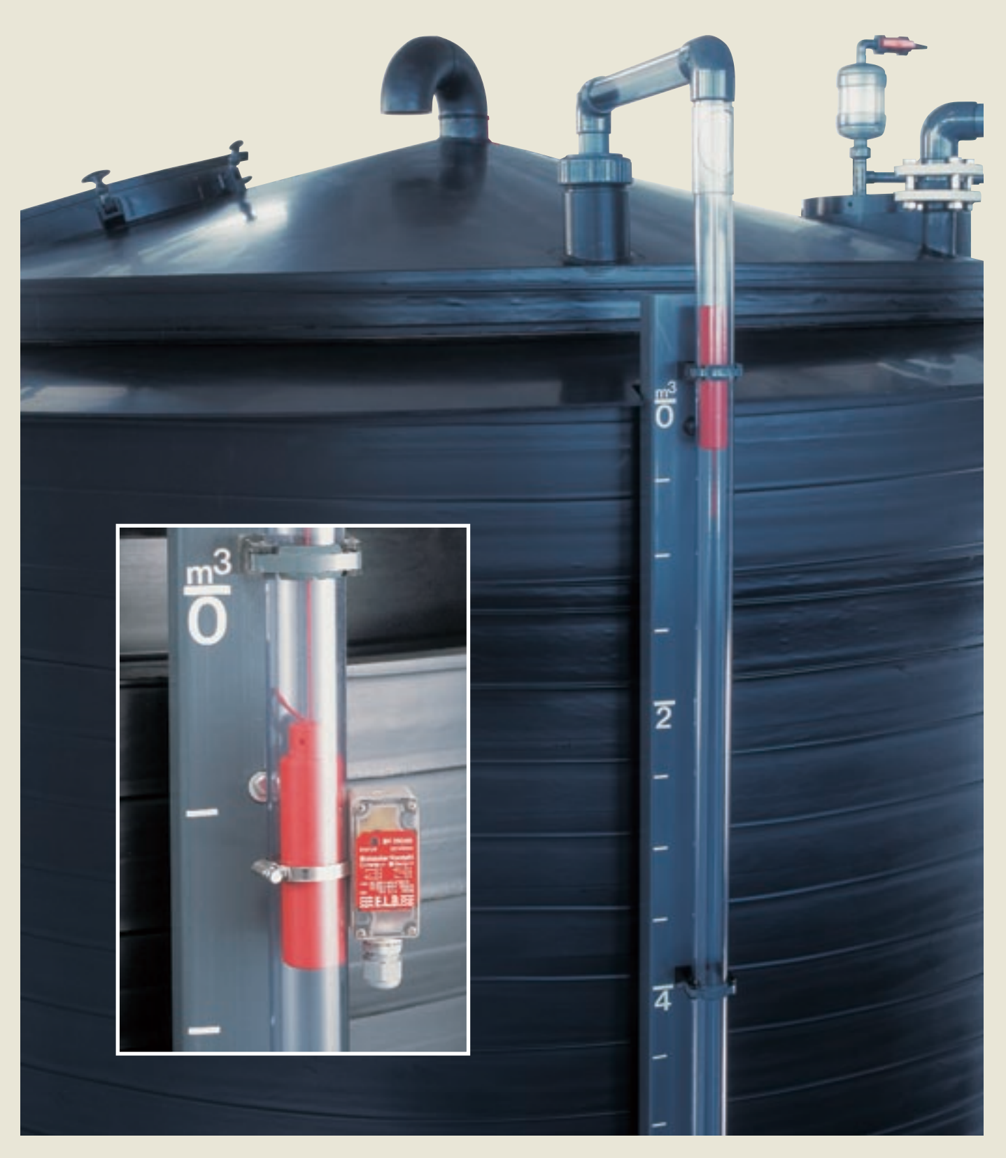
Liquid Level Indicator

For safe measuring and precise indication of liquid level inside storage tanks